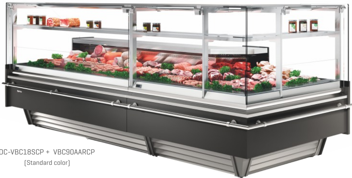
IDC-VBC18SCP + VBC90AARCP [Standard color]