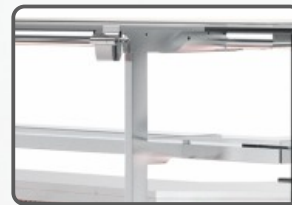
Anodized aluminium profile