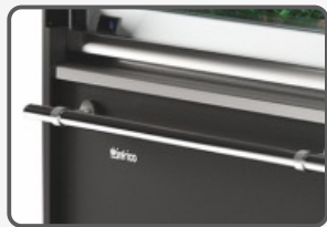
Front bumper [VBC]