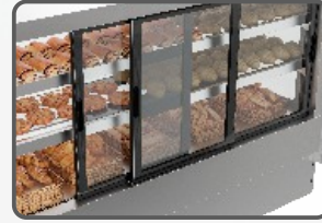
Back doors [VBR R/PR]