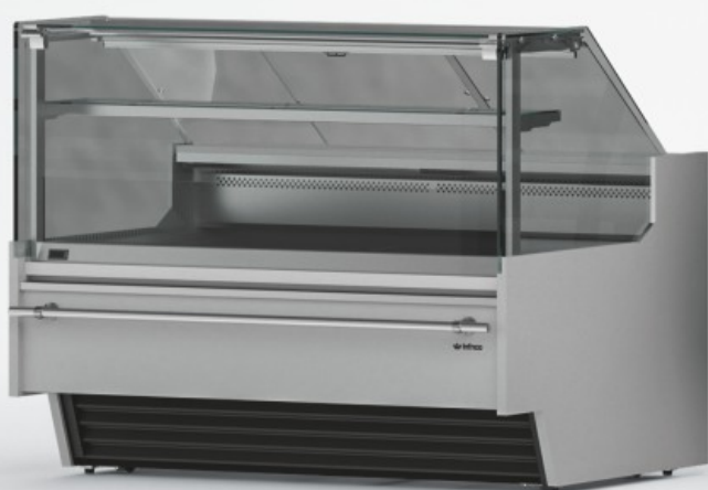
VBC15R CP / S CP