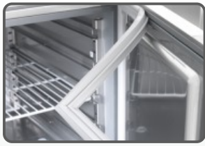
Triple chamber snap in door gasket for easy cleaning