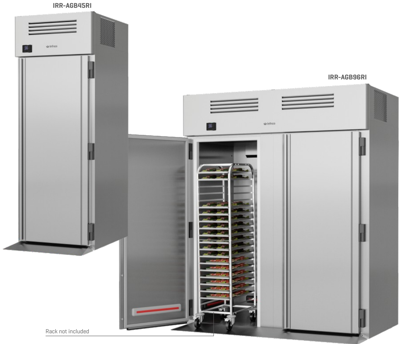
Rack not included