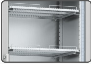
Interior features of IRR-AGB23BT